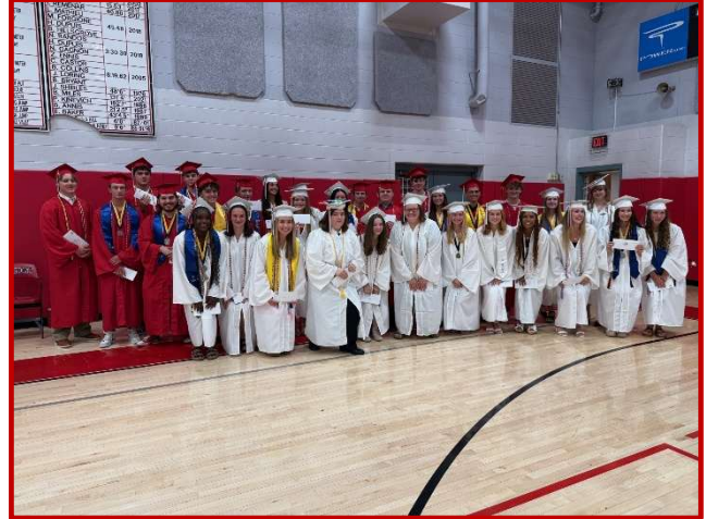
Area High School Award Night Ceremonies. Laconia High School (left), Belmont High School (right).