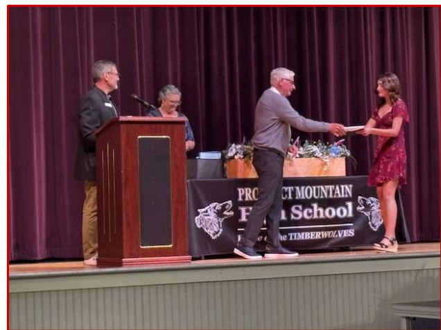
Award Nights and Celebration of Achievement ceremonies. Huot Career and Technical Center (left), Prospect Mountain High School (right).