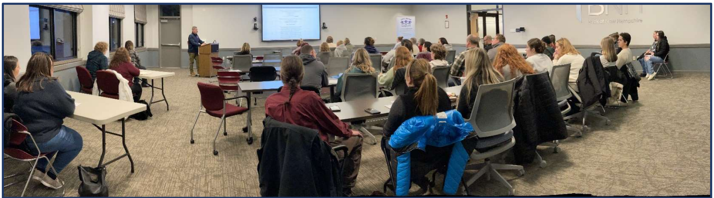
Our first Application Information Session of the year was held on January 9, 2024 at the BNH Operations Center. It was a great opportunity for students and parents to learn about LRSF and how to begin the application process. Thank you to BNH for the use of the room, and Thank You to Sal's Pizza for providing pizza for the evening!

The 2024 - 2025 LRSF Scholarship Application can now be found on our website: www.lrscholarship.org under the "Applicants" tab. The final deadline for filing an application is Monday, April 1, 2024. We have a few unique scholarships that are exceptions to our usual application process. Each of these may have a separate application to be filed along with our application. Check our website for more specific details. Annalee Thorndike Art Competition Scholarship - is available to high school seniors planning on majoring in art related fields The Stockwell Scholarship - is an essay competition, focusing on Patriotism, open to students from Gilmanton, NH Klaus Biemann Science Scholarship - an essay competition for Prospect Mountain HS students who intend to major in science at a four-year school. We also have two special awards sponsored by the Lakes Region Builders and Remodelers , available to students going into a construction related fields.