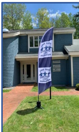
When you see our display flag at outdoor events! Stop by and say "hi"!