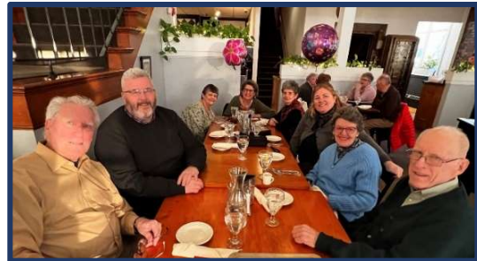
A great time was had by all at our Annual LRSF Benefit Night at held in March at Fratello's Restaurant! Thank you to all who participated!