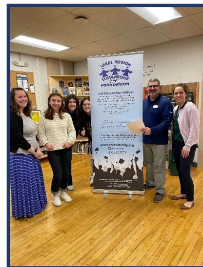
We held an informational session at Laconia High School to answer questions about the application process and helped students complete their LRSF applications. We offer this to all of our local high schools.